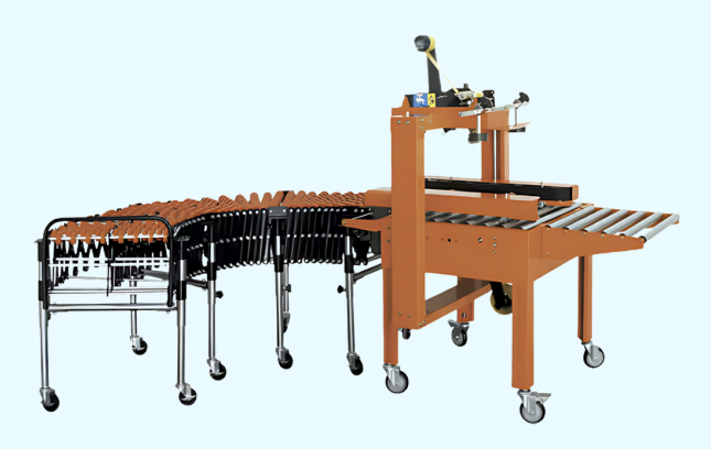
KESILER - MA Model Side Drive Carton Sealer