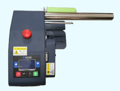
Air Cushion Machine XD-300