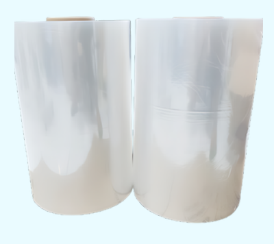
POF & LDPE Shrink Film