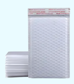
Bubble Mailer Bag