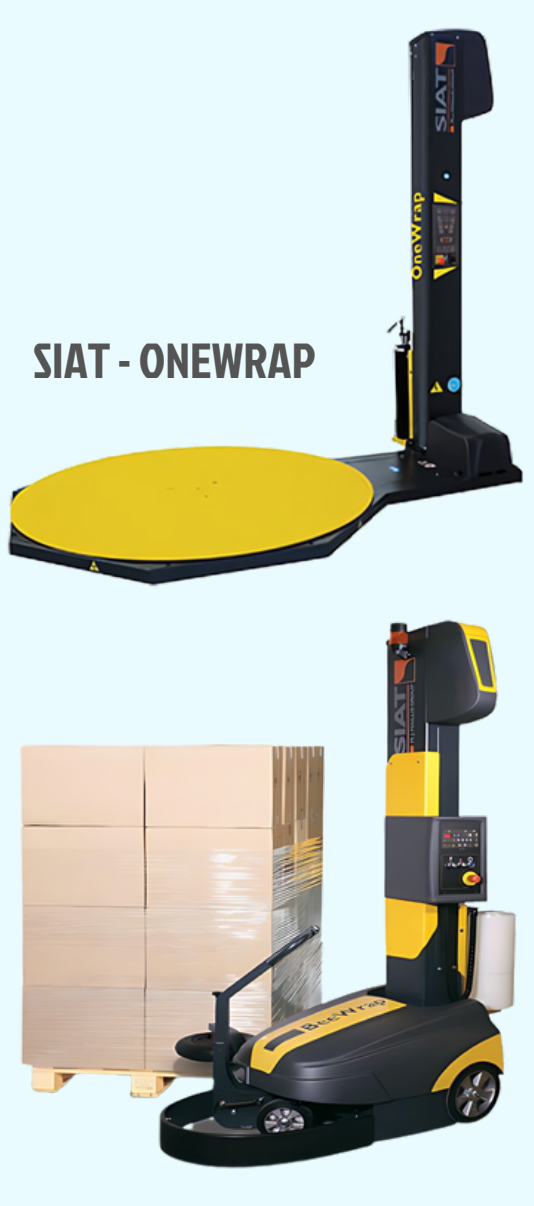
SIAT - BEEWRAP