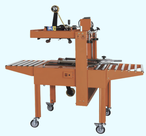
KESiLER - MD Model Top & Bottom Drive Carton Sealer