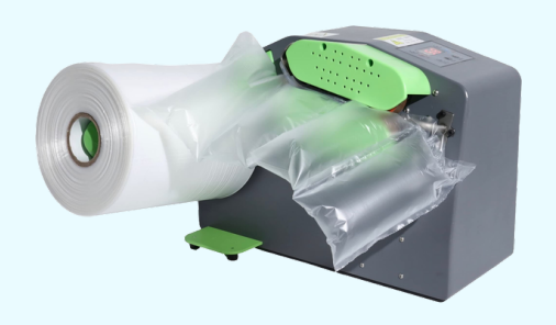
Air Cushion Machine XD-100